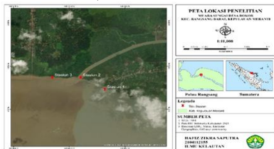
Figure 1. Research Location